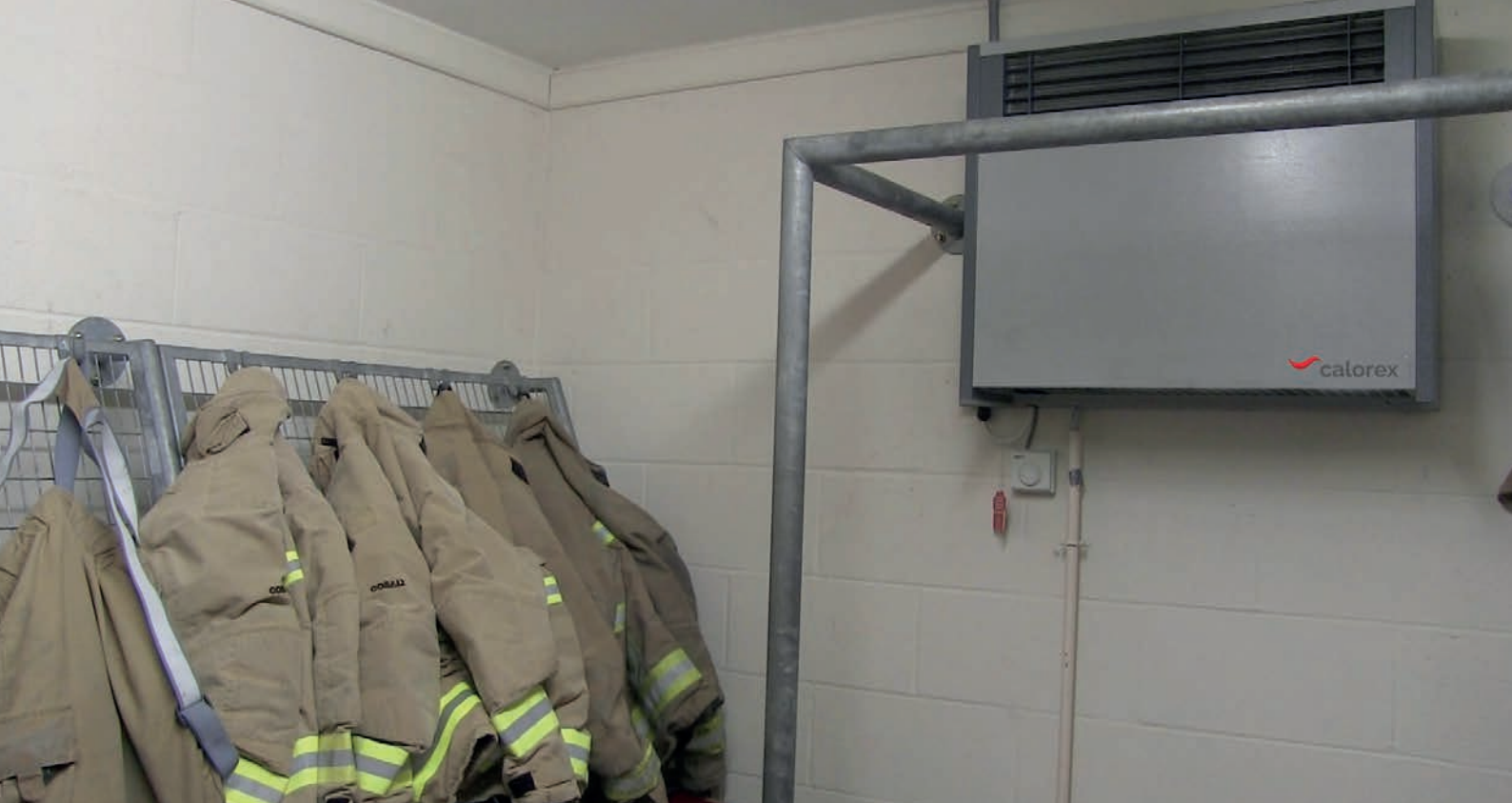
Calorex DH 30 installed in the drying room at Maldon Fire Station

changing, Calorex acted fast to help their local fire service and provide them with their new machine.