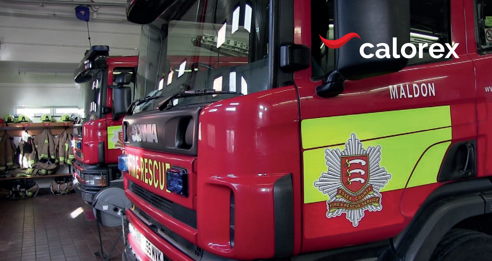
Maldon Fire Station