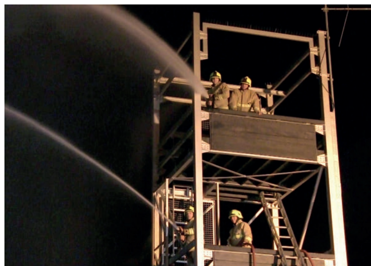
Essex firefighters training at Maldon Fire Station

Calorex dehumidifiers are already installed in many fire stations across the country, including the London Fire Brigade Training Centre at Southwark.